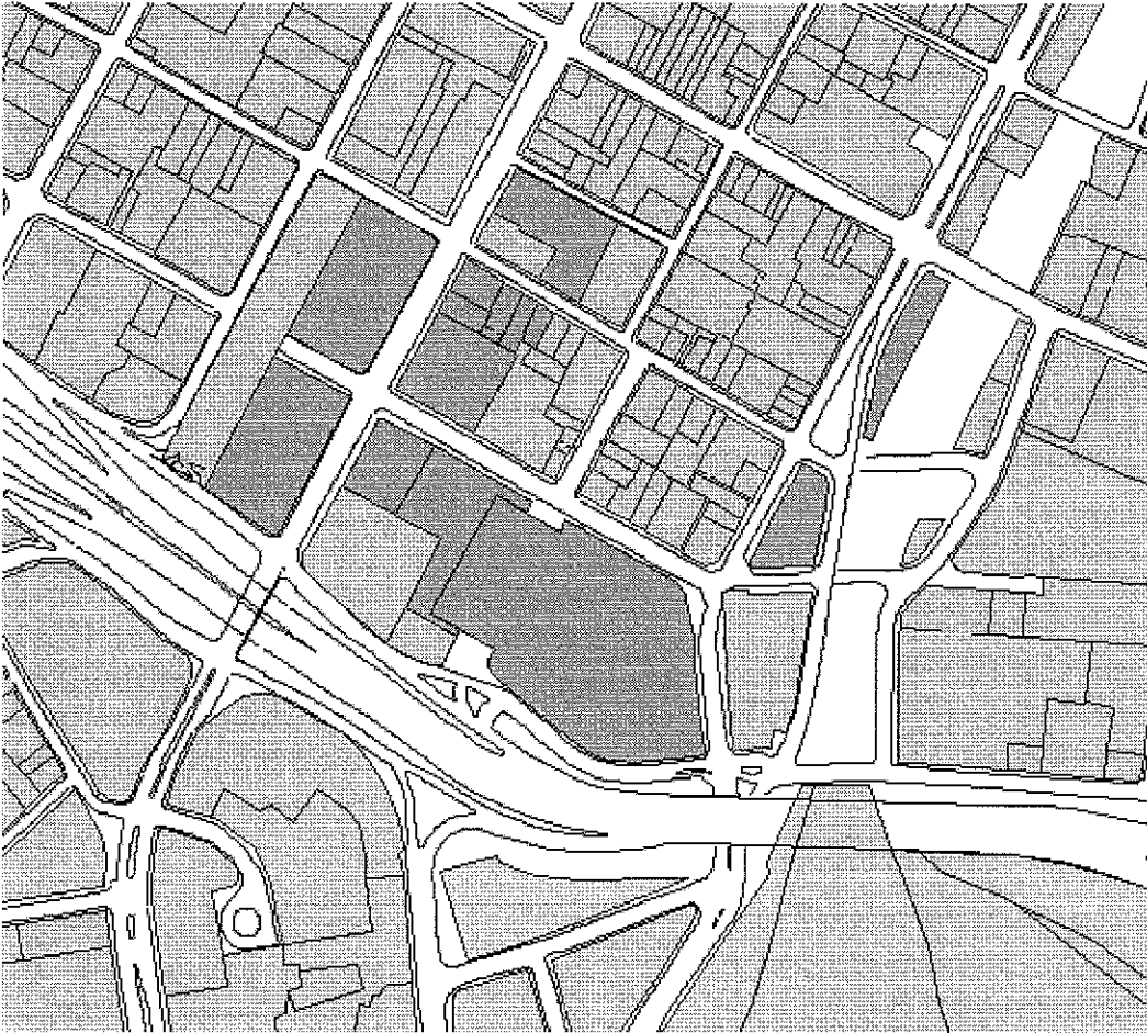
Figure 1: Parcels in the project area