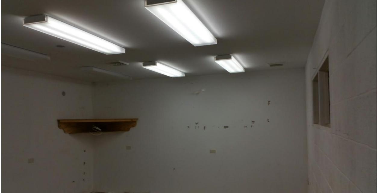
CONFERENCE ROOM-NEW WALLS, ELECTRICAL, FLOOR, ROOF