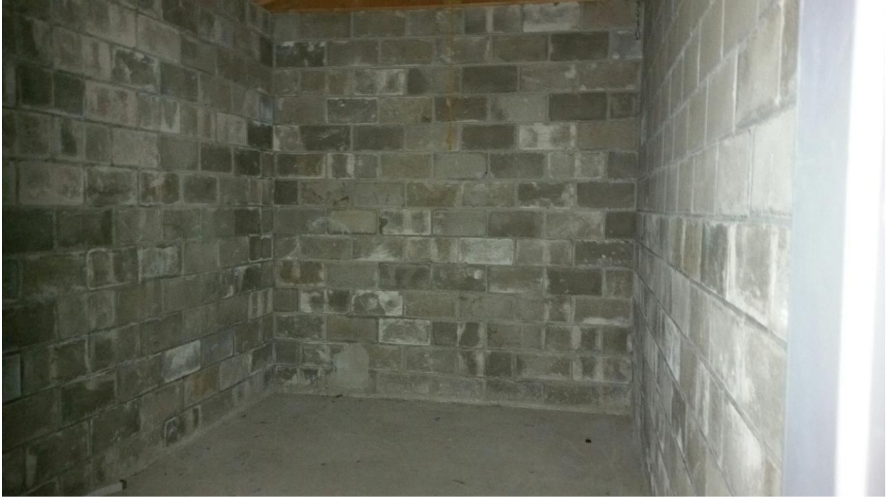
NEW ADDITION, DONATED BRICKS FROM LOCAL 1, NEW FLOOR, NEW BUILDING EXTERIOR