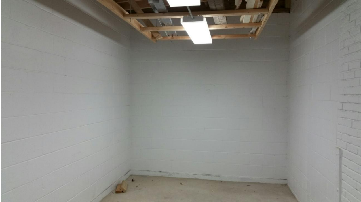
SECOND ADDITION NEW WALLS, NEWLY PAINTED, NEW FLOORING, NEW LIGHTING SYSTEM NEW BUILT ROOF EXTERIOR ADDITION TO STRUCTURE.