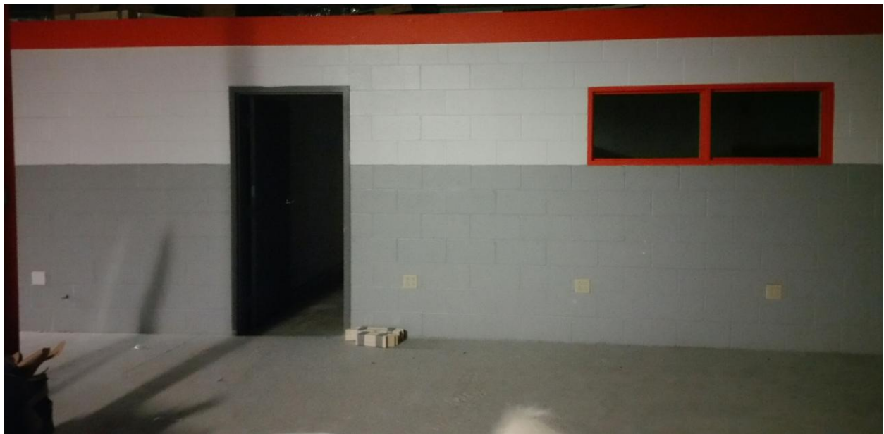
NEW WALLS, BUILT , NEW DOOR SYSTEMS, NEW WINDOWS DONATED GLAZIERS UNION, NEW BRICKS, NEW ELECTRICAL SYSTEMS, NEW ELECTRICAL, NEW CEILINGS, NEW FLOORING