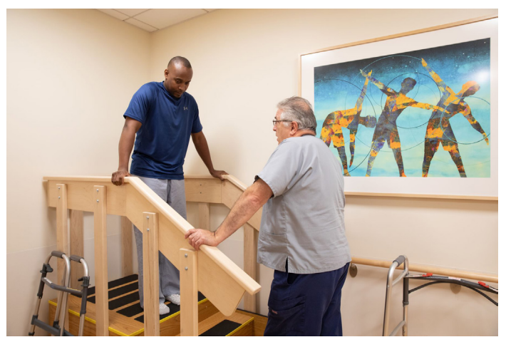
Patient engaged in post procedure therapy at the new McGivney Surgical Center