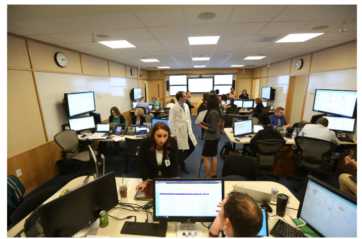
YNHH's new Capacity Coordination Center is staffed 24/7 by representatives from departments throughout the hospital, who can easily view detailed data that help improve care quality and safety and patient flow.

To provide the safest, highest-quality care and ensure patients are in the right care settings and receive appropriate treatments in a timely fashion, Yale New Haven Hospital launched the new Capacity Coordination Center (CCC). Staffed 24/7 by staff from various Hospital departments, along with representatives from American Medical Response, the CCC includes monitors and display dashboards showing real-time data, including bed capacity, patient transport status, ED operations, nurse staffing and other critical information. The dashboards can also show "predictive analytics" can help the Hospital prepare for surges in patient volume and/or influxes of patients with complex conditions.