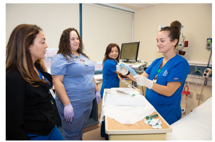
Neurosciences ICU staff members review safety procedures to prevent CAUTIs.