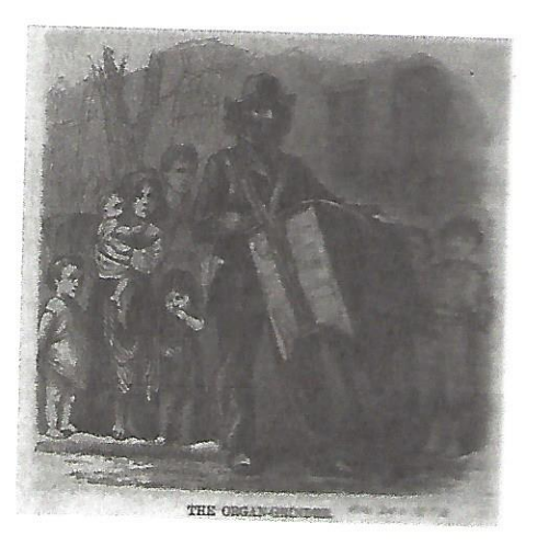
Figure 13.1 "The Organ-Grinder." A drawing by Charles Stanley Remains ber 1873), 34.

objectionable. Americans read a steady flow of outrageous account innocent travelers were regularly assaulted on lonely Italian roads mass Italian emigration there were patronizing depictions of Itals persisting stereotypes. A campaign against organ grinders see Fagu York City from the 1850s, and almost all of them Italian, led to an public nuisance.<sup>3</sup>