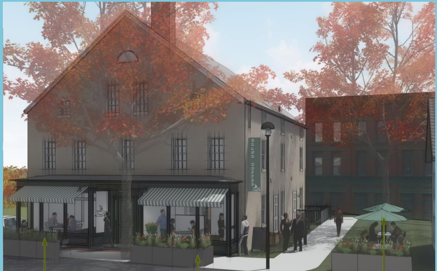
CHAIRS & TABLES